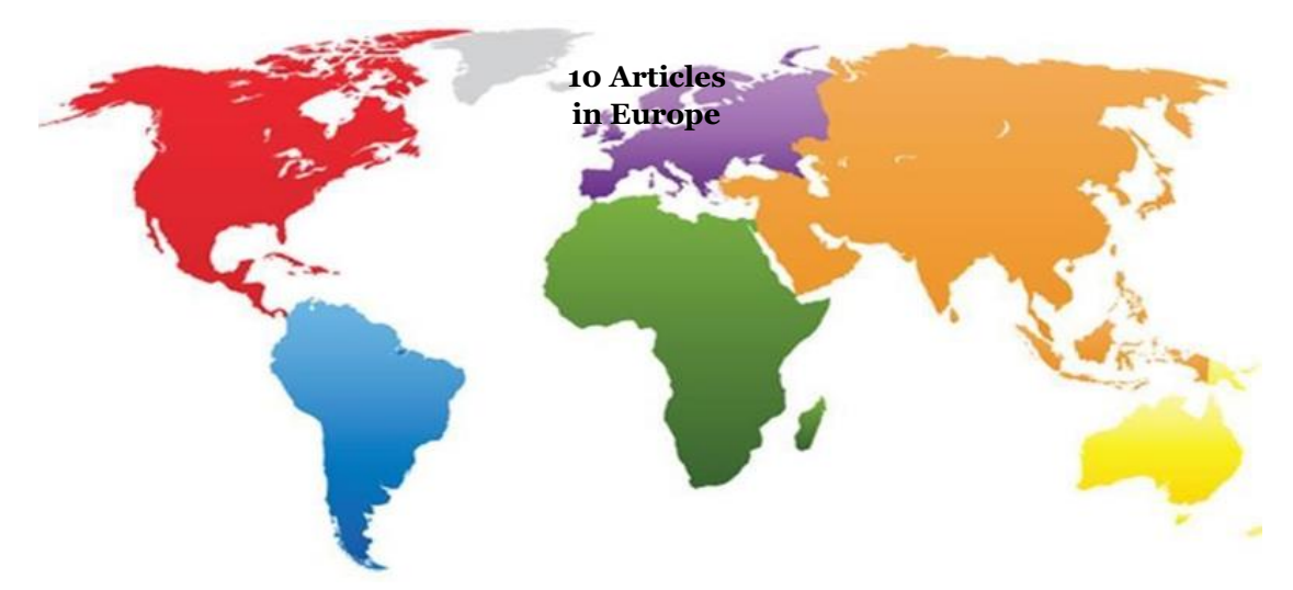
Figure 2. Research areas on the effect of vaccination on covid-19 infection

The regional map in Figure 2 shows the distribution of primary study articles on the European continent consisting of 4 studies from England, 2 studies from Spain, 2 studies from Denmark, 1 study from Italy, and 1